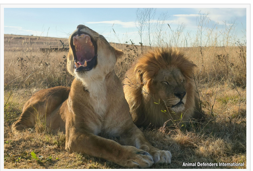
Photos and videos of rescued circus lions' relocation from France and release at ADI Wildlife Sanctuary, South Africa.

The rescue marks another important step in the global Stop Circus Suffering campaign which has seen more than