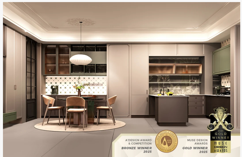
monika series whole-house design from oppolia

The Monika Series reinterprets classical aesthetics through a modernist lens, balancing ornate heritage details with clean, functional lines. This design philosophy manifests itself most strikingly in its curated color narrative. The cloudy gray color provides a neutral canvas that breathes architectural serenity. Against this backdrop, classical emerald green emerges with botanical richness, while warm, earthy brown grounds the palette with a reminiscence of Mediterranean chic. These hues interact dynamically; emerald cabinetry panels reflect light like forest canopies, brown textured finishes absorb the shadows to create depth, and gray surfaces present a pearl-luminous beauty. Together, they craft spaces that feel simultaneously timeless and contemporary, where colors age with refined grace rather than fade.