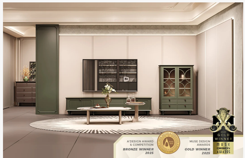
monika series living room from oppolia