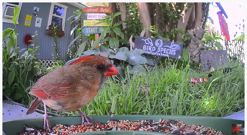
"Molly's Firehouse," is located in the backyard of Dayna's home