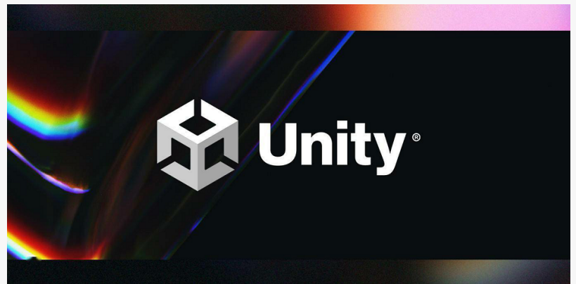
Unity Engine Encryption Solutions