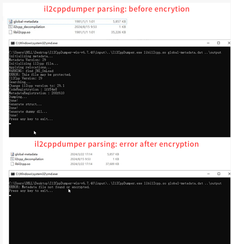
Unity Engine Encryption Solutions