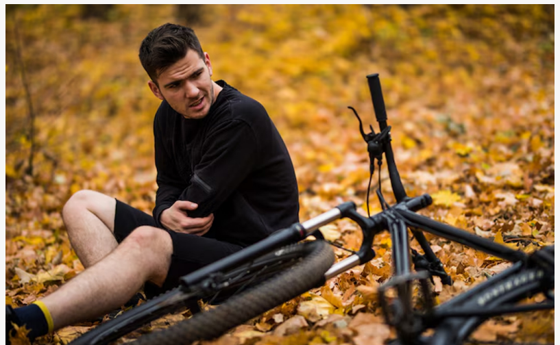
bicycle accident attorney near me