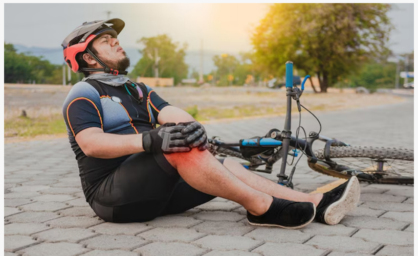
california cycling laws