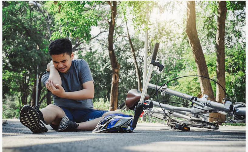
bicycle accidents attorneys

recommendations for safer cycling infrastructure. His legal experience is particularly relevant as California continues to update its transportation policies to prioritize safety for non-motorized road users.