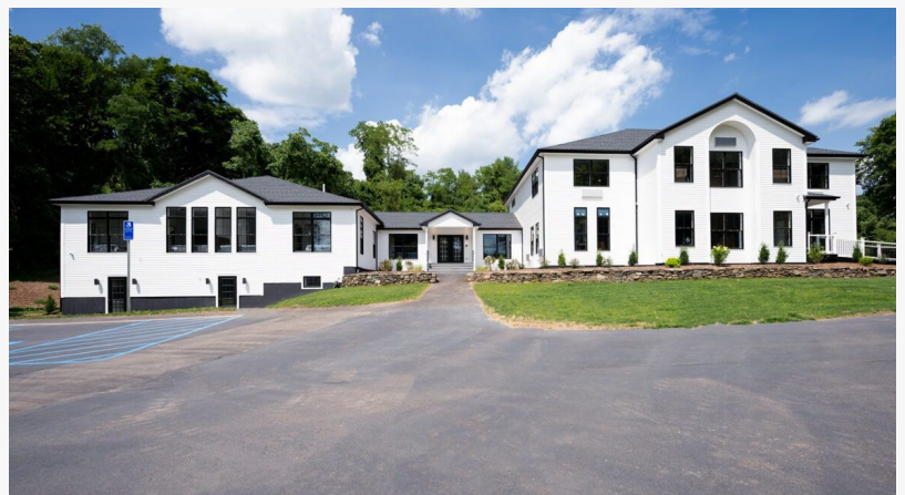
Paramount Wellness Connecticut Recovery Center Substance Abuse Treatment