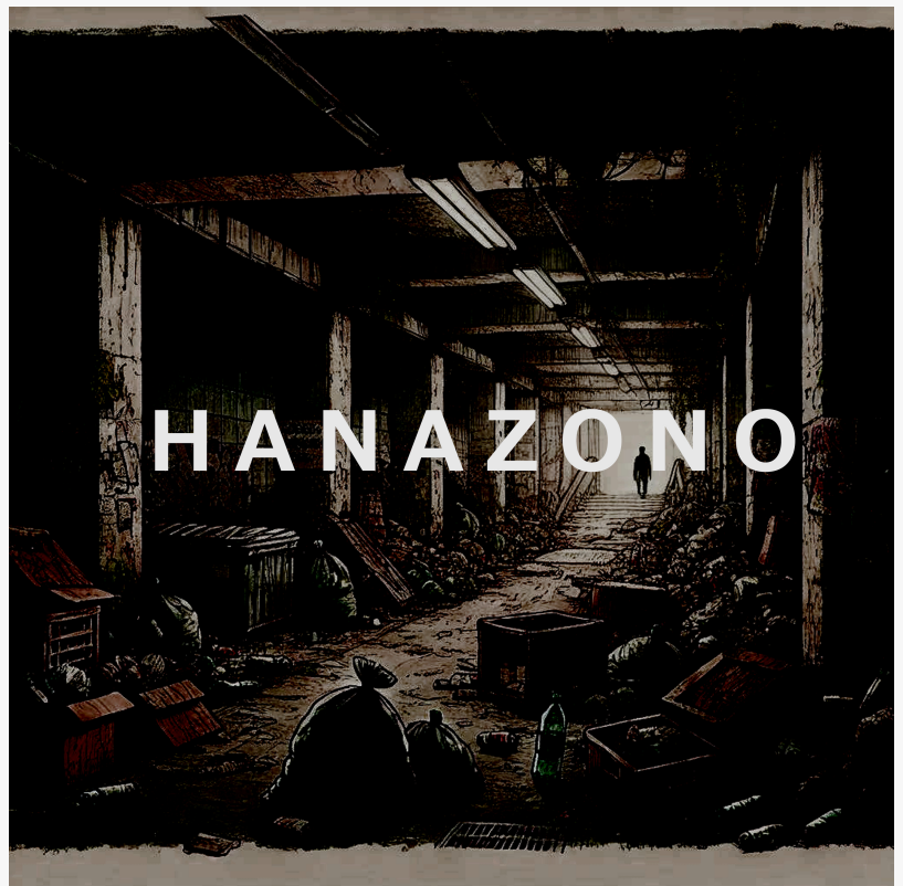
Cover image of "HANAZONO" by NISHIOKA, ranked #3 on iTunes US Singer-Songwriter chart and #1 on Alternative Folk.