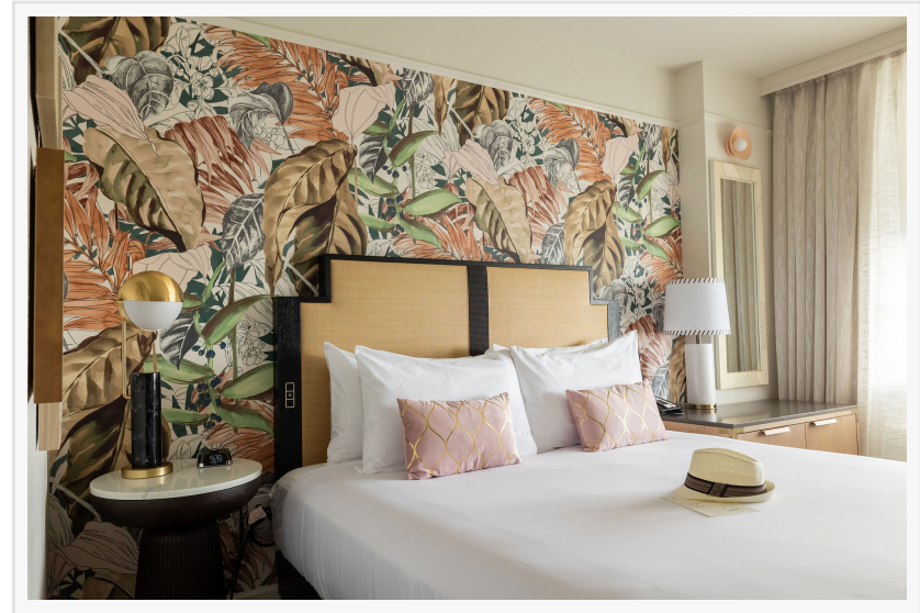
La Concha Key West Guest Room

Hand-selected for their inherent craft and distinct perspectives on design and hospitality, Autograph Collection properties offer rich immersive moments that leave a lasting imprint. For more information, please visit <a href="https://www.autographhotels.com">www.autographhotels.com</a>, and explore on social via Instagram, X, and Facebook to be inspired by immersive moments that are #ExactlyLikeNothingElse. Autograph Collection is proud to participate in Marriott Bonvoy®, the global travel program from Marriott International. The program offers members an