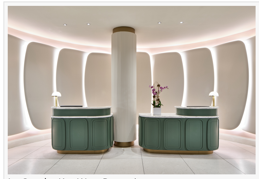
La Concha Key West Reception

About Autograph Collection® Hotels Autograph Collection Hotels advocates for the original, championing the individuality of each of its over 320 independent hotels located in the most desirable destinations across more than 50 countries and territories. Each hotel is a product of passion, inspired