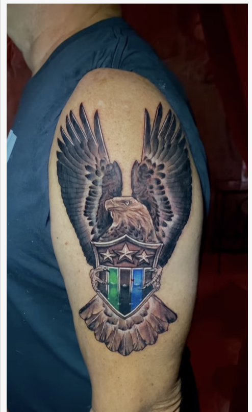
Patriotic eagle tattoo by Elvis, featuring an American shield with colored bands—an homage to service, strength, and national pride

This press release can be viewed online at: https://www.einpresswire.com/article/819734322