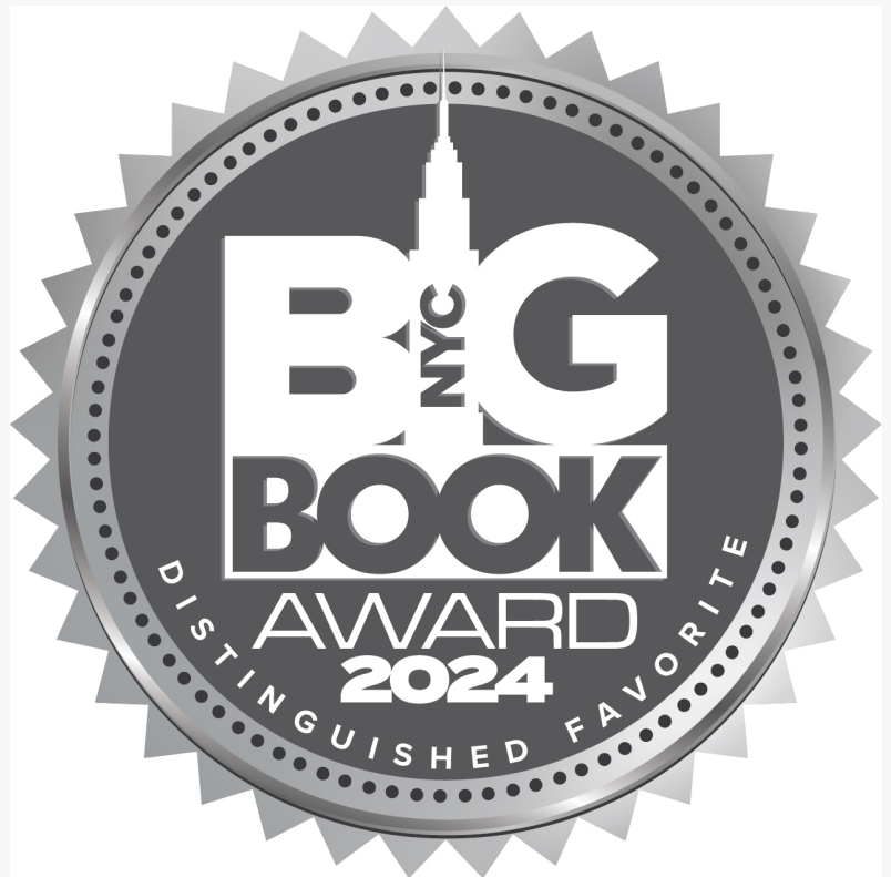
A 2024 NYC Big Book Award Distinguished Favorite