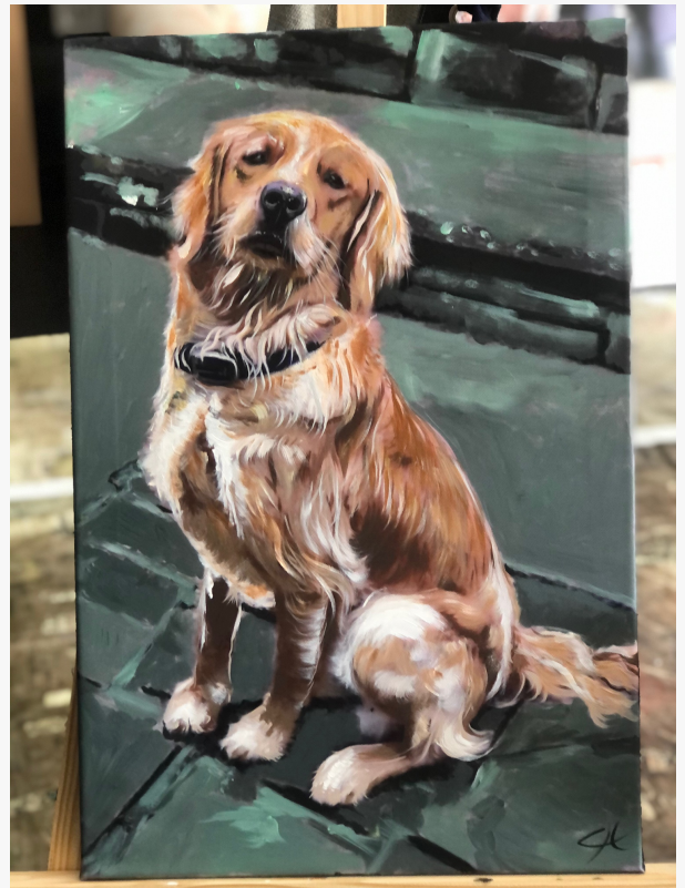
Bear - the hairiest retriever