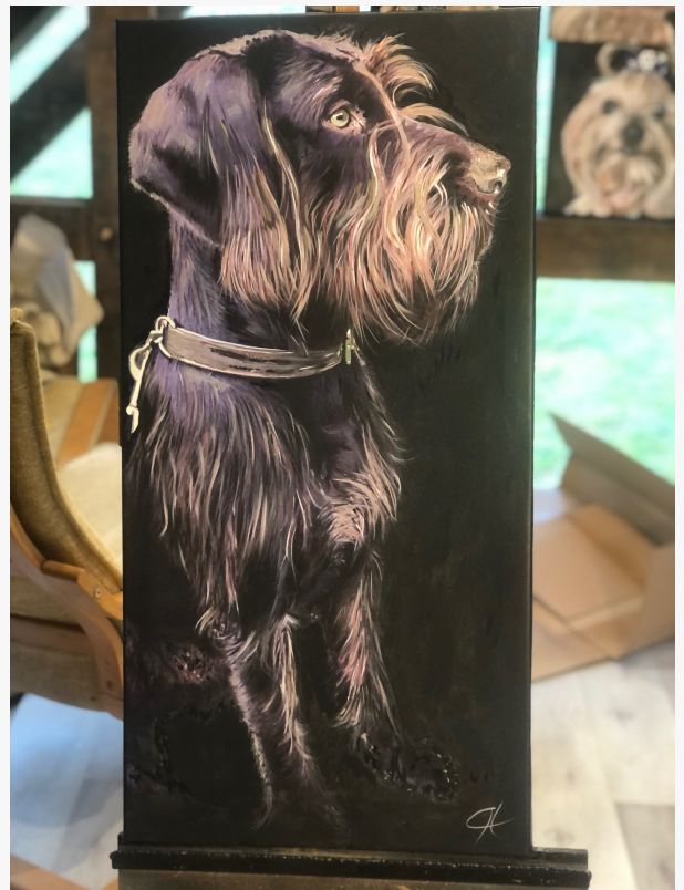
after painting 2000 dogs I completely forget their names