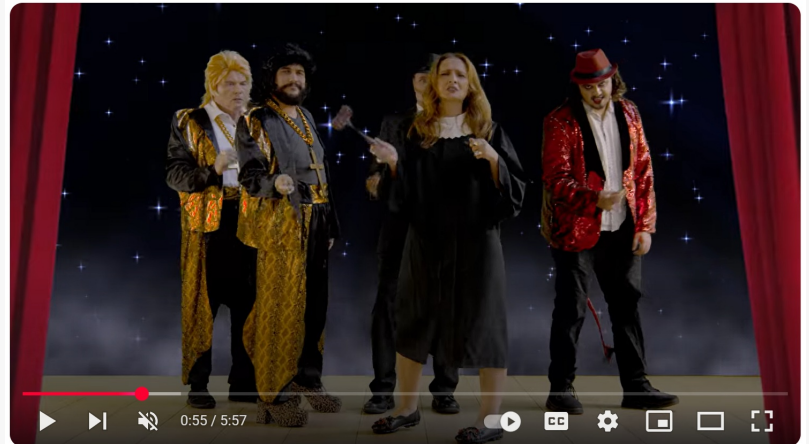
Trailer for the comedy musical Shangri-La-La

Comedy Musical Shangri-La-La at the Arlington Drafthouse Virginia in July.