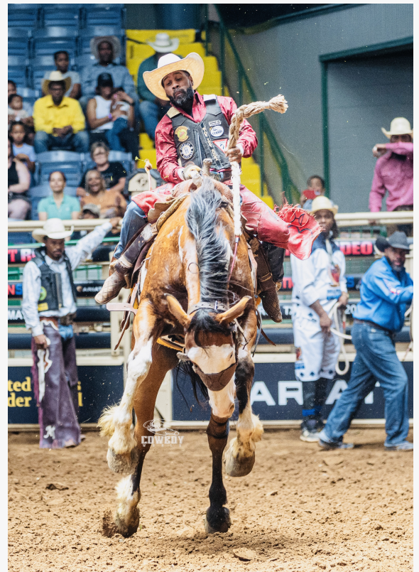
BPIR Texas Connection Bronc Rider

Audiences are invited to experience two dynamic performances at 1:30 p.m. CT and 7:30 p.m. CT, each showcasing elite Black cowboys and cowgirls in a thrilling display of rodeo sport, cultural pride, and community unity. Tickets are available now at www.billpickettrodeo.com and www.cowtowncoliseum.com .