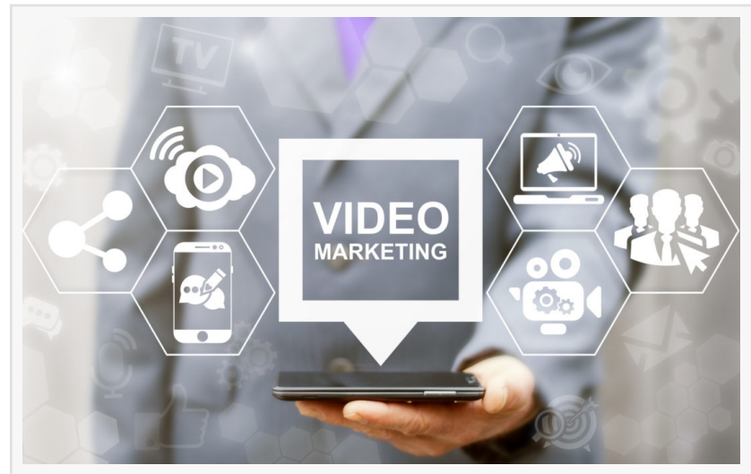
Video Marketing for Attorneys