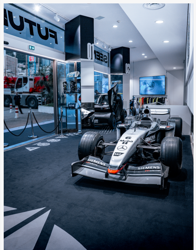
The Arsenale Monaco view 1