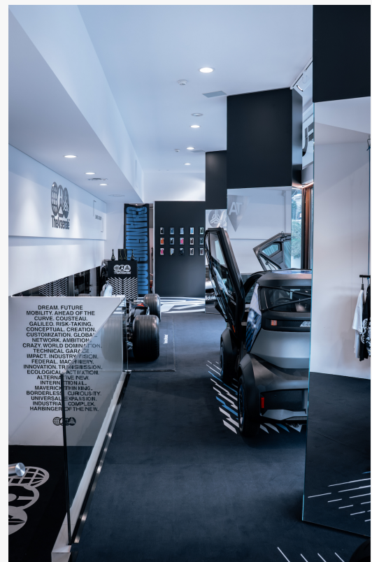
The Arsenale Monaco view 2