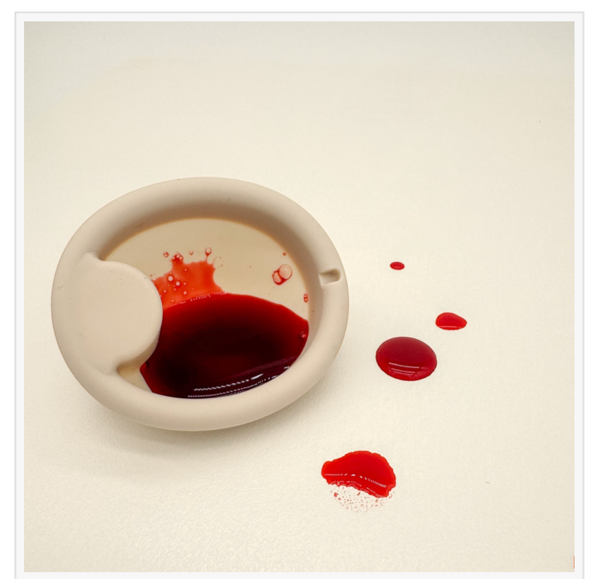
The Mimi® disc holds up to 30ml of menstrual fluid - or about 6 tampons combined, giving you longer wear and fewer changes, even on heavy days.

Founded in Canberra, Australia, Mimi & Co is an award-winning woman-founded brand committed to creating beautifully designed, high-performing reusable care products. Since 2020, the company has built a loyal following through its Mimi® modern cloth nappies, reusable Mimi® menstrual pads, and commitment to customer care, ethical sourcing, and long-term value. Mimi & Co believes that small changes create meaningful impact, for families, communities, and the planet.