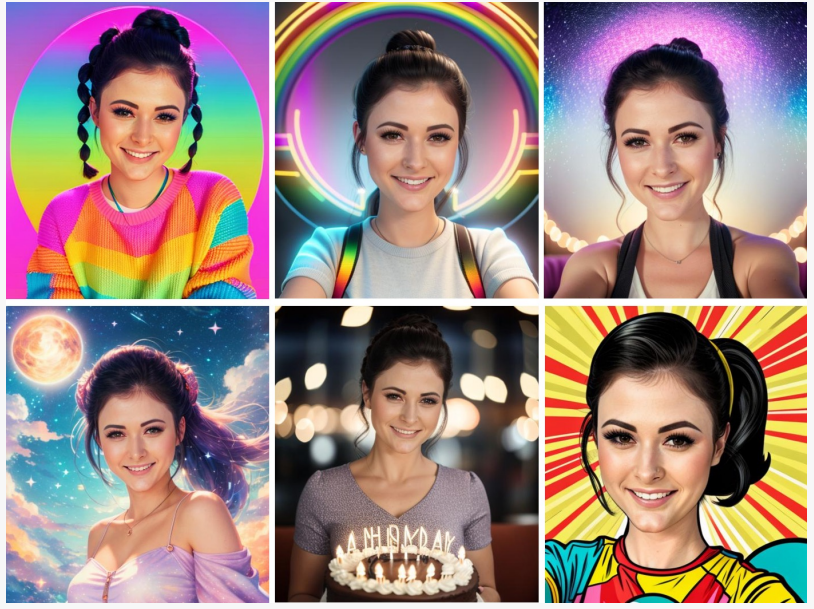
Just for Fun, Still on Face: Perfect for memes, profile pics, and personal creative play — without prompt writing or style loss.

Global, Consistent, On-Brand: Generate editorialquality content with one face — perfect for campaigns and creators.