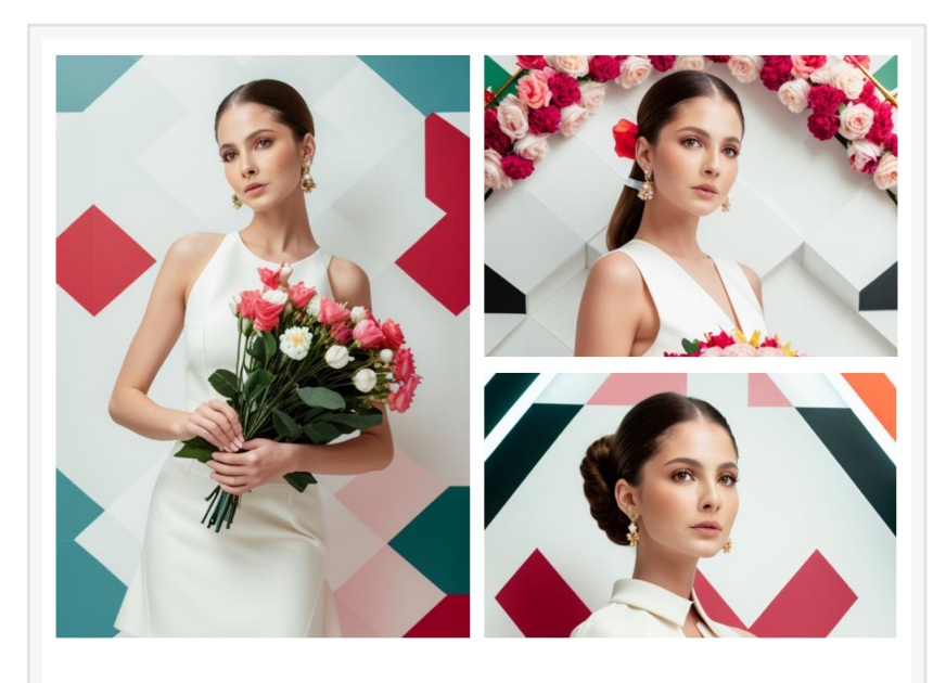
Seasonal & Stylized: Reuse the same face in bright, themed visuals — ideal for content creators and social storytelling.

NEW YORK, NY, UNITED STATES, June 11, 2025 /EINPresswire.com/ --<u>Playform</u> AI, a pioneer in AI-powered creativity tools, announces the official launch of <u>FaceCraft</u>, an all-in-one AI suite for face generation, editing, and transformation. Building on Playform's legacy as one of the first AI image generators since 2019, FaceCraft redefines what artists, creators, and casual users can achieve with cuttingedge AI face tools.