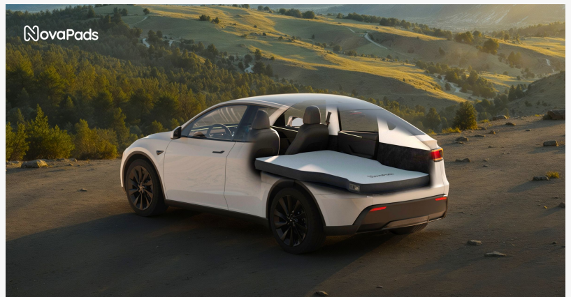
Tesla Model Y Juniper Mattress Pro

1. Powered Rear Seats: Tesla Camping Prep Enters the "One-Touch Era" For campers who frequently sleep in their Model Y, folding and unfolding the rear seats has always been a necessary but tedious chore. The previous generation required manual operation, which was time-consuming, labor-intensive, and often accompanied by an ungraceful thud when the seats dropped. The Juniper version solves this perfectly: One-touch electric folding via a button on the left side of the trunk — the entire process takes just 10 seconds. Paired with a supportive Tesla Model Y Mattress , this creates a spacious