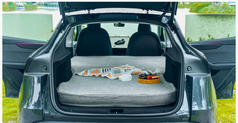
Tesla Model Y Mattress Pro with Free Sheet