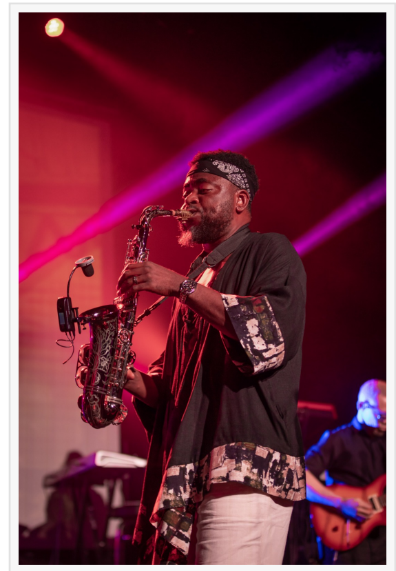
ONAH's powerful new soundtrack of survival and resilience is available on major streaming platforms

Fenji Productions Kalabar Records +1 800-770-5766 email us here