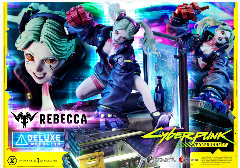
Real Elite Masterline Cyberpunk: Edgerunners Rebecca

The Deluxe Bonus Version of the statue includes additional display options. These parts allow Rebecca to be posed either with Broseph or wielding the high-powered weapon "Guts." It also includes a counter chair and interchangeable head stands to support multiple configurations. Furthermore, this version includes a bubblegum-blowing head part.