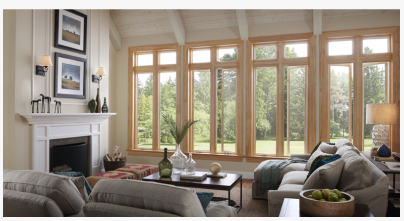
Window and Door Installation