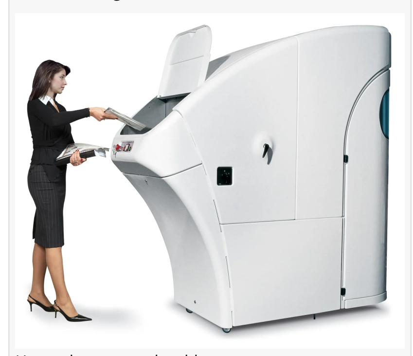
Heavy duty paper shredder

and improve efficiency. The introduction of <u>Vestil Manufacturing products</u> represents a significant advancement in material handling components, including heavy-duty equipment like