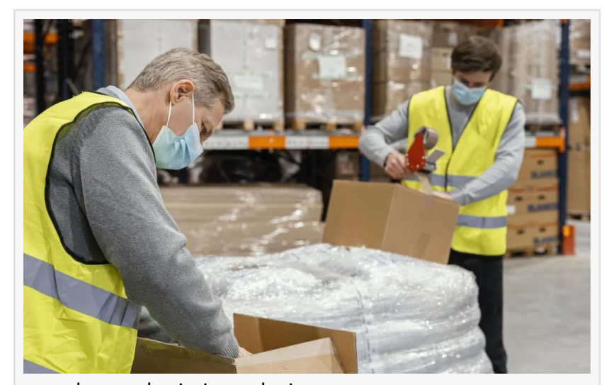
warehouse logistics solutions

As a trusted partner in logistics and supply chain operations, Sam Logistics & Supplies Inc. is committed to delivering cutting-edge solutions that help businesses optimize productivity