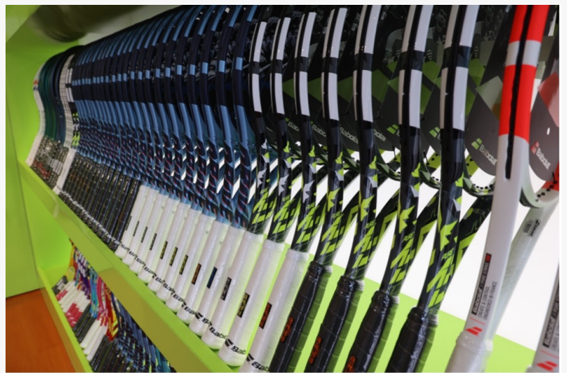
Atmosphere

Located in the heart of East Hampton and soon to open in Palm Beach, Florida Set Point Tennis offers a curated selection of top-of-the-line Tennis Racquets, Sneakers, and Apparel and Accessories for Men, Women and Children. Brands range from classic trusted product lines to fashion-forward athletic apparel and accessories. Our racquet specialists can set you up with the