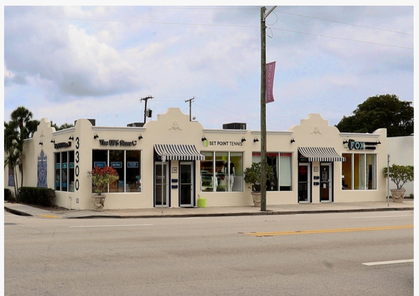
Set Point Tennis Palm Beach Exterior

This press release can be viewed online at: https://www.einpresswire.com/article/820425194