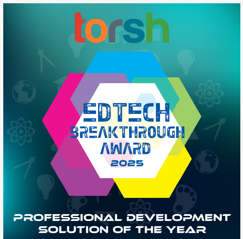
TORSH wins the 2025 EdTech Breakthrough Award for Professional Development Solution of the Year

TORSH Talent , TORSH's flagship product, integrates easily into existing routines and systems to support the full coaching cycle: structured observations, formative assessments, feedback, goal setting, goal tracking, collaboration, and data-driven insights. TORSH's high-impact coaching ecosystem is accessible at scale - whether in-person, virtual, or hybrid. The platform also integrates AI with human-centered coaching for additional flexibility and scale. TORSH Talent provides an exceptional framework for collaborating, performing observations, and delivering