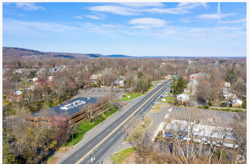
The Recovery Team - New Jersey Aerial View

Each aspect of the program is designed to treat both the substance use disorder and the underlying emotional or psychological issues that often accompany it.