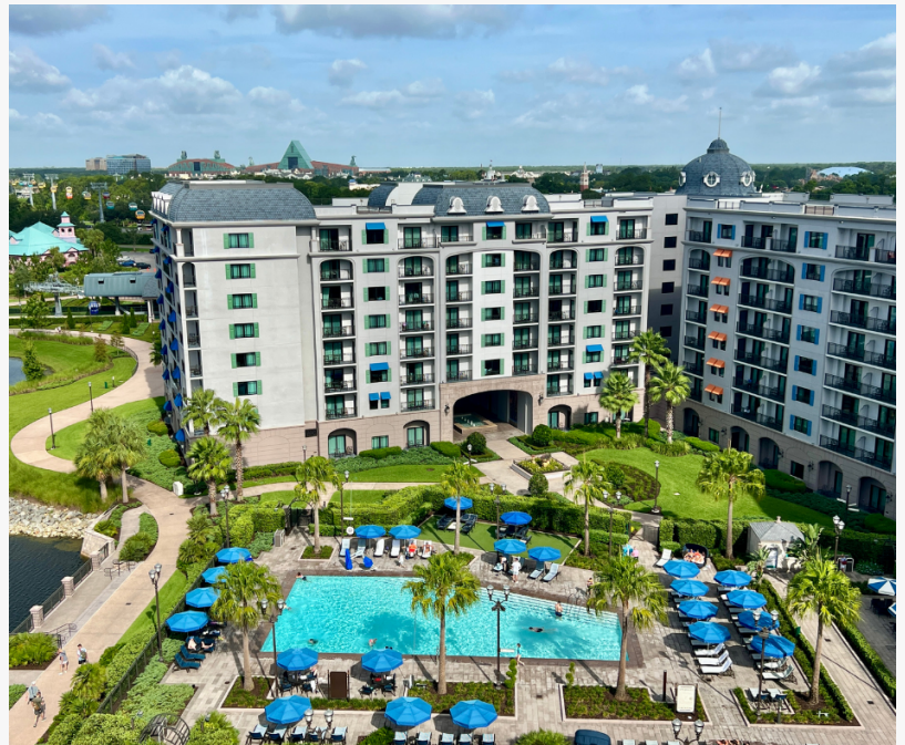
DVC Title Alert - Exclusive DVC Title Monitoring and Identity Theft Protection for DVC Owners

company guarantees current pricing will remain in effect for the lifetime of subscriptions enrolled by June 30.