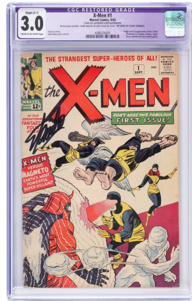
Copy Marvel X-Men #1 (Marvel Comics, Sept. 1963), graded 3.0, with a Stan Lee authenticated autograph, story by Stan Lee and artwork by Jack Kirby. (CA$7,670)