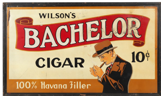
Canadian 1920s single-sided lithographed tin sign with a wood frame for Wilson's Bachelor Cigars ("100% Havana Filler"), 36 ½ inches by 60 ¾ inches, graded 8.5. (CA$7,080)