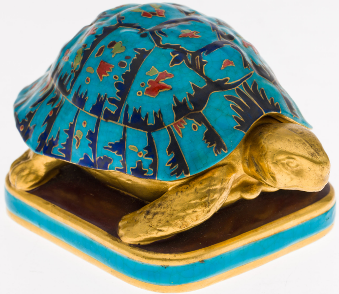
Minton turquoise-ground figure of a turtle with a gilt body and additional gilt accents, 1871. Size: 2¾in x 4in wide x 3¼in deep. Estimate: $5,000-$7,000