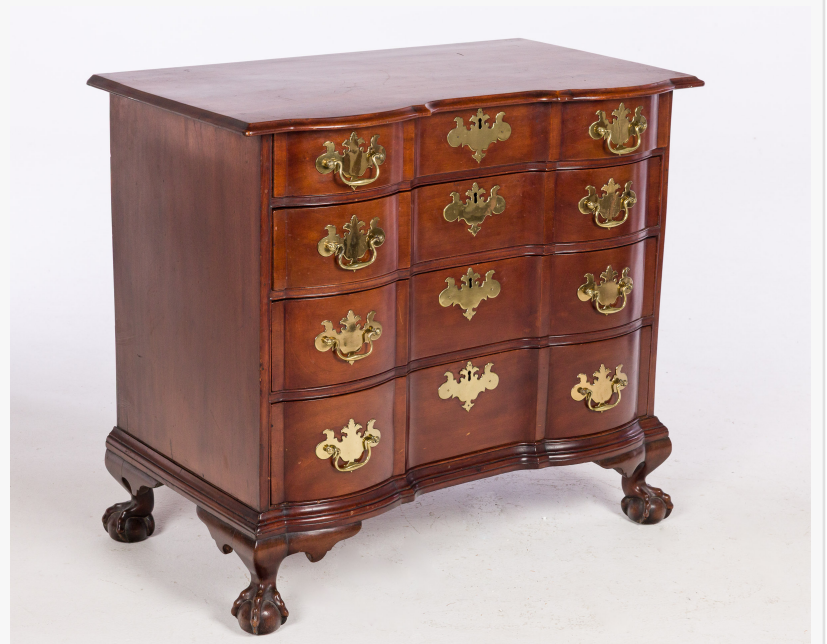
Chippendale mahogany blockfront chest of drawers, circa 1760, probably of Boston origin. Provenance: 1990s purchase from legendary American furniture dealer Israel Sack. Estimate: $30,000-$50,000