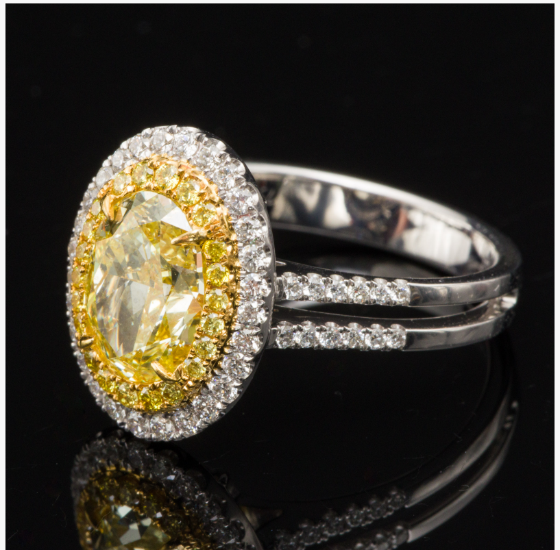
18K white gold ring with oval modified brilliant-cut Fancy Yellow Diamond (2.51 carat, S12 clarity) with round brilliant-cut diamonds (approx. 0.17 carats). Overall weight: 5.9g. Size 7. Comes with GIA colored diamond report. Estimate: $12,000-$18,000