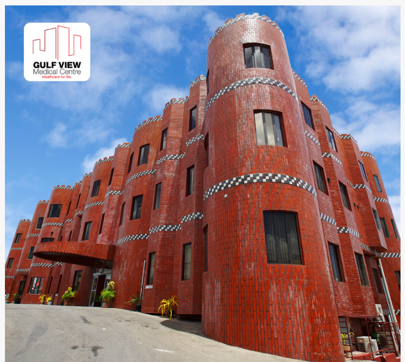
Gulf View Medical Centre, Trinidad

The collaboration began with the implementation of outpatient clinic and billing modules and quickly scaled to include inventory, inpatient care, operating theater, laboratory, radiology and emergency services. By mid-2021, Gulf View had completed a full hospital-wide deployment of the system, bringing digital efficiency and real-time data access to every department.