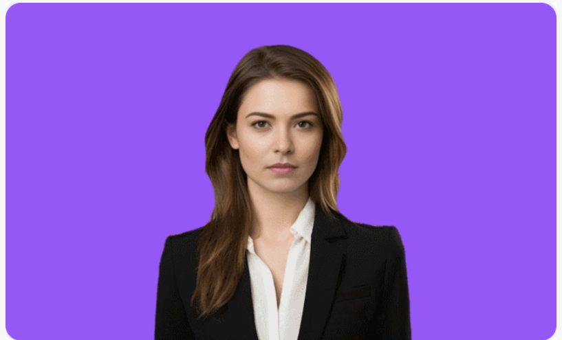
Mango AI allows users to create AI talking avatar videos with ease.

With the AI talking avatar generator, users can effortlessly bring their ideas to life. They simply choose a pre-designed digital avatar or create a custom character, enter their text script, choose an AI voice, and the tool generates an expressive and professional talking avatar video within minutes. Its user-friendly design makes it accessible to everyone, even those without specific technical knowledge.