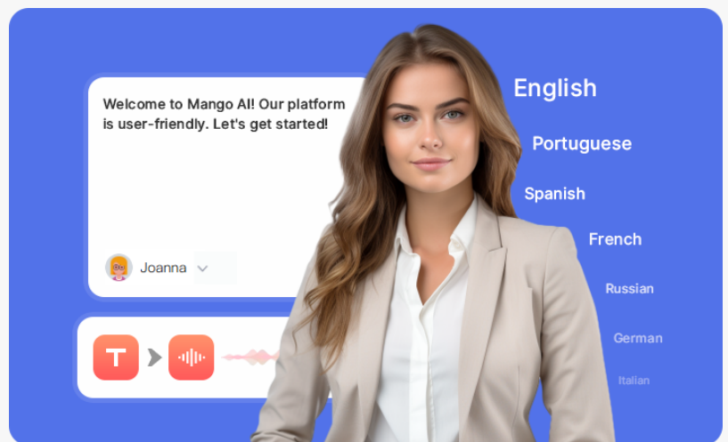
Mango AI's free video translator translate videos in over 120 languages.