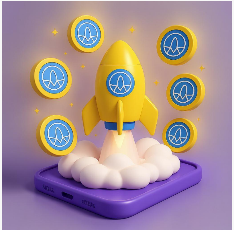
$MOONRIG TOKEN SALE

Moonrig's AI-powered, modular DAPP is designed to help users make secure investment decisions, matching the rigor of legacy financial analytics giants – now rebuilt natively for Web3. The platform bridges companies and investors through tools that enable intelligent, real-time financial strategies.