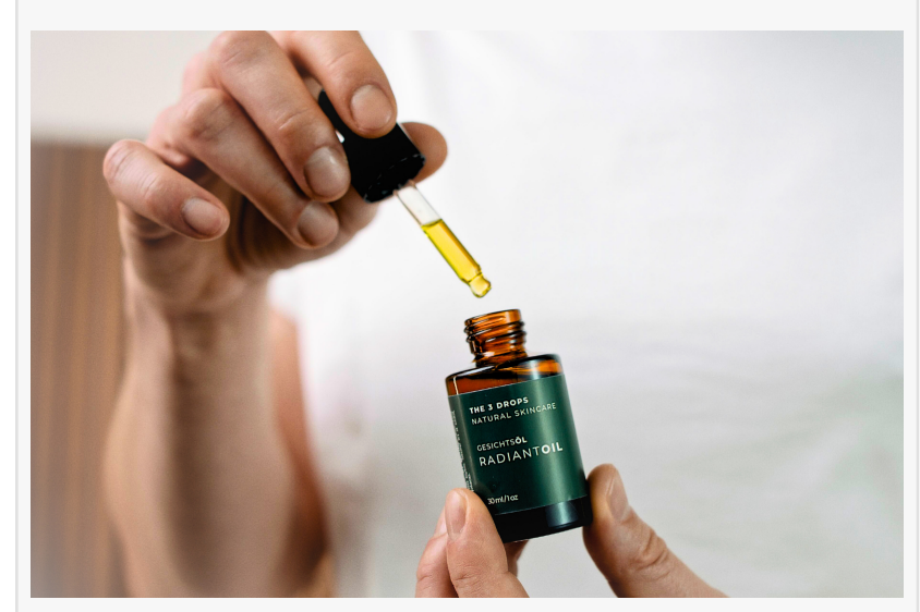
THE 3 DROPS – Clean, vegan skincare for men who value simplicity and performance.

does not offer international shipping at this time, which has added to the product's allure. Those who want to try it must know someone in Germany who can send it to them – a detail that has made it something of a cult discovery among in-the-know beauty lovers, skincare minimalists, and globally minded consumers.