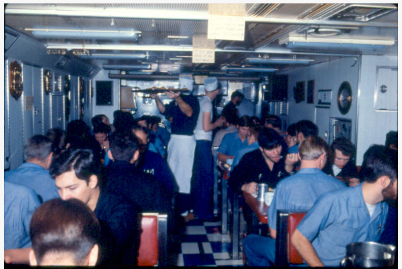
3 Watch Sections and 110 Men Had Their Meals Here- The Crews Mess

But instead of a fictionalized version of this unseen confrontation, Poopie Suits gives the reader a front row seat to the true story of the battle of wills and wits beneath the ocean's surface.