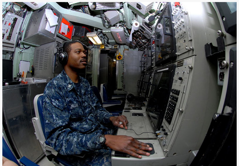
How Did Sonar Work - Explained in Easy to Read Detail

It continues with the hardest part of the training, Nuclear Prototype Training. This details the arduous 6 months of learning “normal” operations of a submarine reactor, to learning all the emergency operation and recovery drills, with many variables thrown in. Every pipe, every valve, every operational switch, button, meter had to be traced, under deck plates, through bulkheads (walls separating Compartments) with just a stick diagram given.