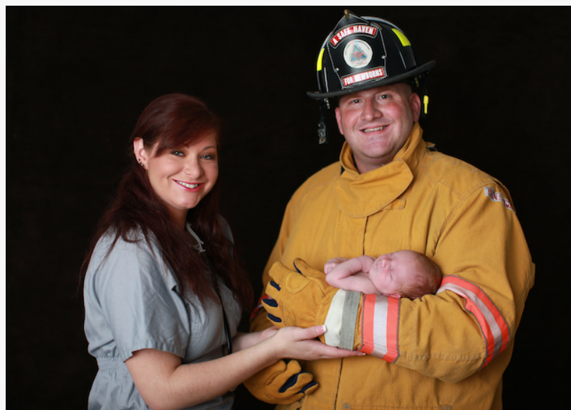
Newborn safely surrendered in the arms of nurses and firefighters

A Safe Haven for Newborns Signage designating hospitals, fire and EMS stations as Safe Haven.