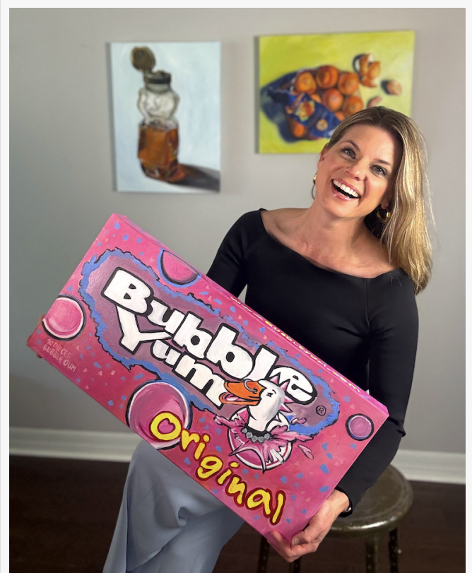
Ashleigh Walters with Bubble Yum Original, Starring Floyd D. Duck - 2024 - Acrylic on Gallery Wrapped Canvas - 12x24x2.5

Learn more about the "Pop Culture" Exhibition: https://delrayoldschoolsquare.com/events/pop-2000-exhibition