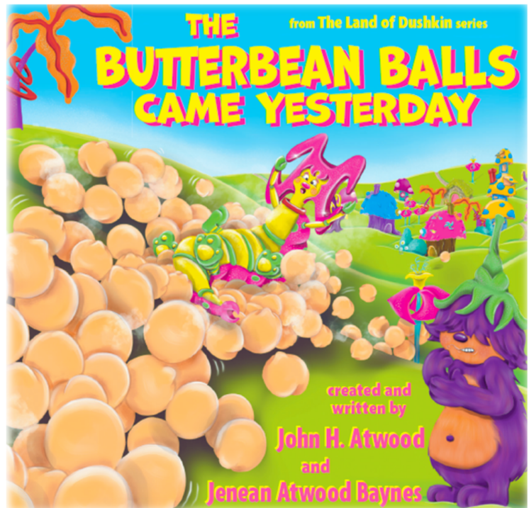
2nd Release from The Land of Dushkin Series

In August, the tour returns to familiar ground with an event at Barnes & Noble in Woodmere, OH, on Saturday the 23rd. This will be a full-circle moment as they previously held an authors' event for their first book, "Blue Spots! Yellow Spots!" at this location. Then, on September 27th, they'll appear at The Learned Owl Book Shop in Hudson, OH, continuing their journey of inspiring young readers across the country. And, they are in the process of confirming events well into the fall.