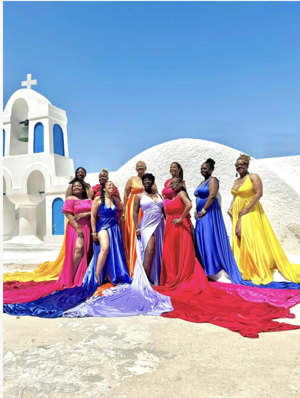
Culture Holidays - Flying Dress in Greece