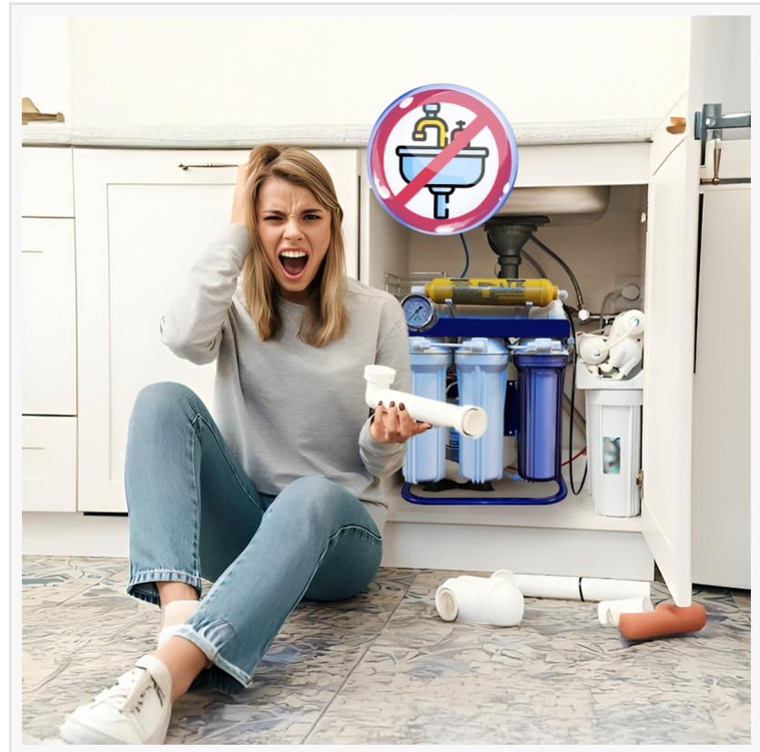
No Under Sink Devices

Founded in 2003 by Kevin Worsfold, One Water Systems is a leading