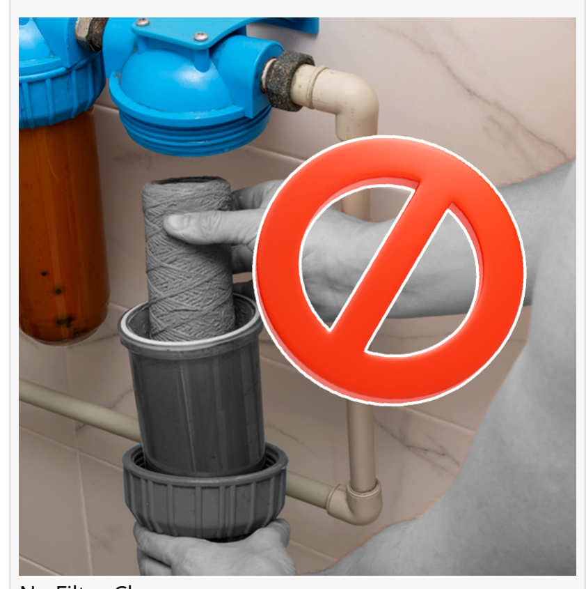
No Filter Changes

personalized service, fast installation, and reliable water testing to ensure every system meets the specific needs of each household. The company also offers air filtration in California, making