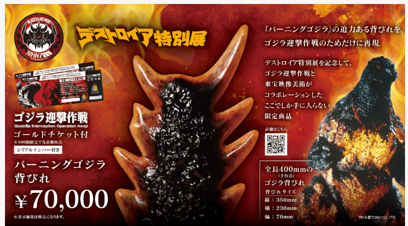
Burning Godzilla Dorsal Fin