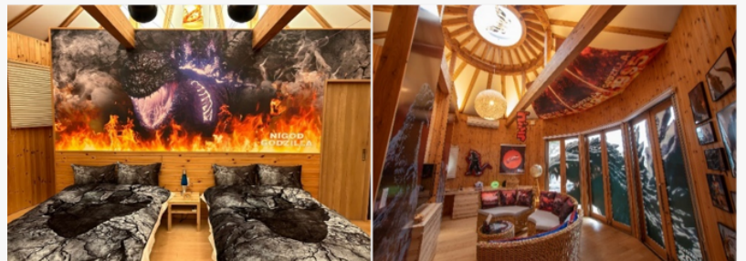
Godzilla-themed room "Monster Land" at Grand Chariot