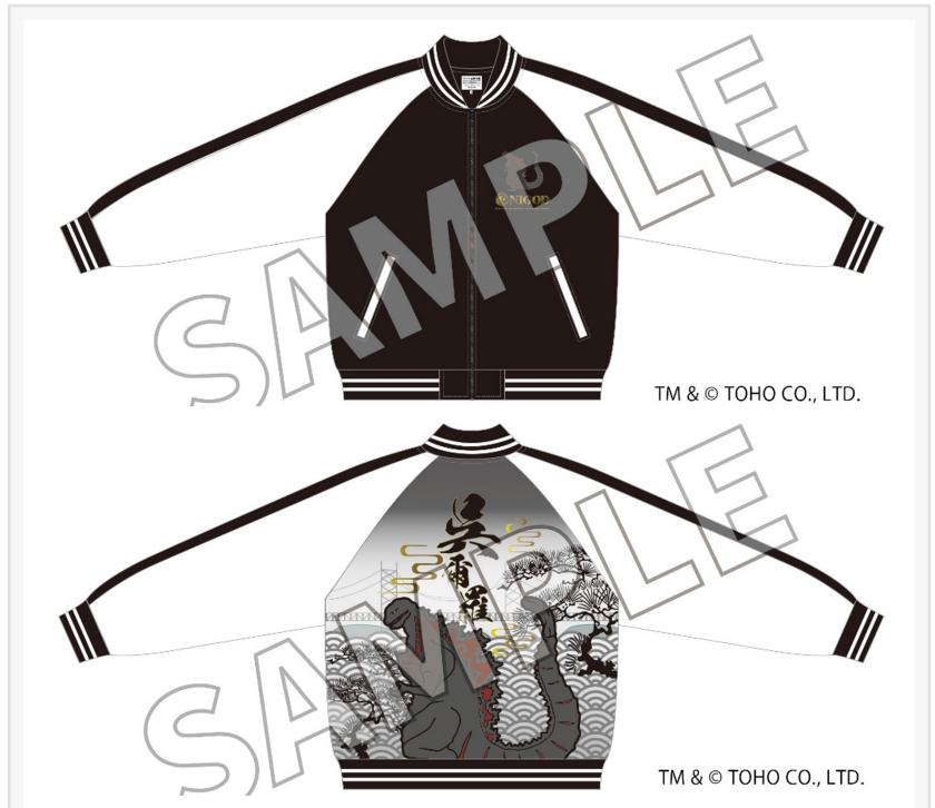
Godzilla Sukajan Jacket (front and back)

"Sukajan jackets" are a type of satin varsity-style jacket with Japanese motifs on the back, popular in Japan. This specially designed sukajan jacket comes bundled with the VIP Journey Pass entry ticket, and features a dramatic scene depicted at the attraction of Godzilla majestically crossing the sea with the Akashi Kaikyo Bridge in the background, set against a traditional Japanese wave pattern known as "seigaiha", as well as Japanese kanji characters spelling out "Godzilla".