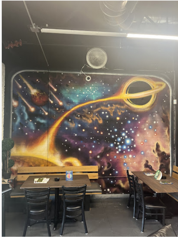
Only Alien Cannabis Co.

Beyond retail, URB participates in local partnerships and charitable efforts across southeast