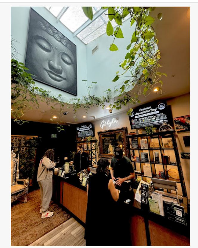
The Higher Path Dispensary

The Station: Customer-Focused Retail in Fresno The Station in Fresno takes a relationship-based approach to cannabis retail. Staff engage directly with visitors through open floor consultations and product recommendations tailored to customer feedback.