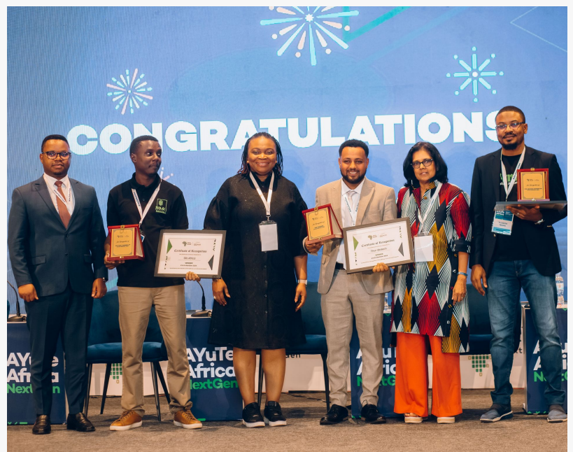
2024 AYuTe NextGen winners with leaders of Heifer International

KAMPALA, UGANDA, June 11, 2025 /EINPresswire.com/ -- Africa's brightest young agri-tech innovators are heading to Kampala, Uganda, for the AYuTe NextGen 2025 Conference, set to take place from June 17 to 19. Created and organized by Heifer International , this high-impact event is a flagship platform designed by youth, for youth, where technology meets agriculture and the continent's most promising agtech entrepreneurs take center stage.