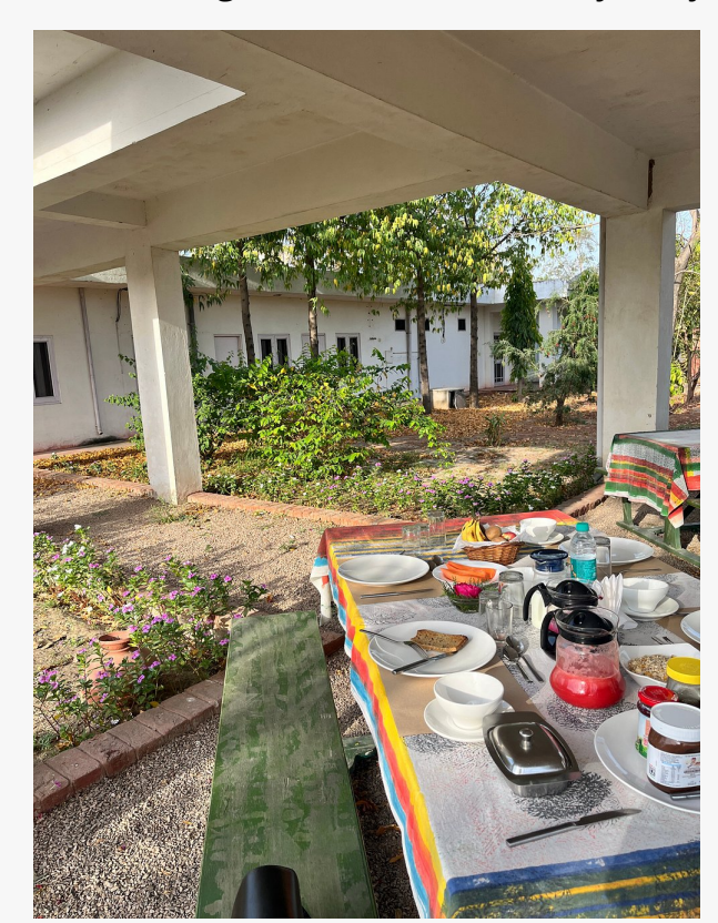
Organic Farm to Fork Food

<u>Jaipur</u>, on a peaceful 12 acre estate surrounded by an agrarian and pastoral economy. With a commitment to sustainability, wellness and authenticity, Savista offers guests a rare blend of eco-luxury, cultural discovery, and renewal. From carefully planned organic meals to immersive local experiences, every stay supports conscious, slow travel.