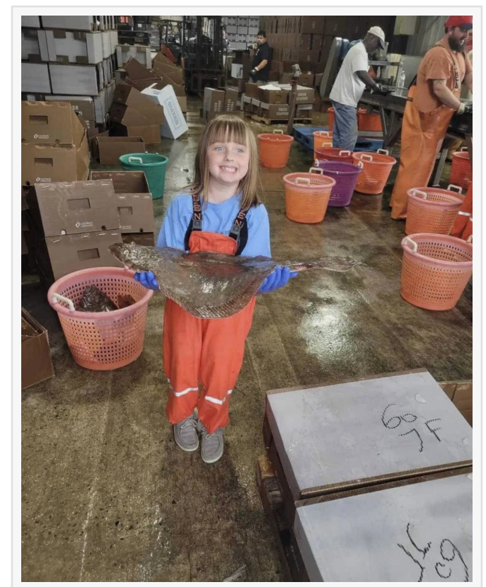
It's all in the family as five generations of Lovgrens have worked the docks in Point Pleasant Beach, NJ.

The motion seeks a preliminary injunction to immediately halt pile driving and construction