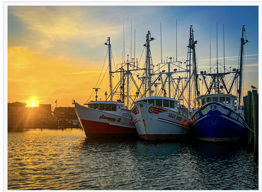
Plaintiffs' vessels await another day working on the water. The boats are the Swaggy B, Lilly Rose and Amber Waves, all Fisherman's Dock Cooperative boats.

The lawsuit (Protect Our Coast NJ et al. v. United States of America et al., Case No. 3:25-cv-06890) also challenges the project's legality under the Outer Continental Shelf Lands Act (OCSLA), as Empire Wind is controlled by Equinor-a company majority-owned by the Kingdom of Norway. U.S. law bars foreign governments from holding offshore energy leases. The Empire Wind 1 project was fast-tracked and approved under the Biden administration, which granted key permits and lease rights before leaving office, enabling a foreign state-owned company to destroy American waters so Norway can profit, despite widespread warnings from fishermen, scientists, and coastal communities.