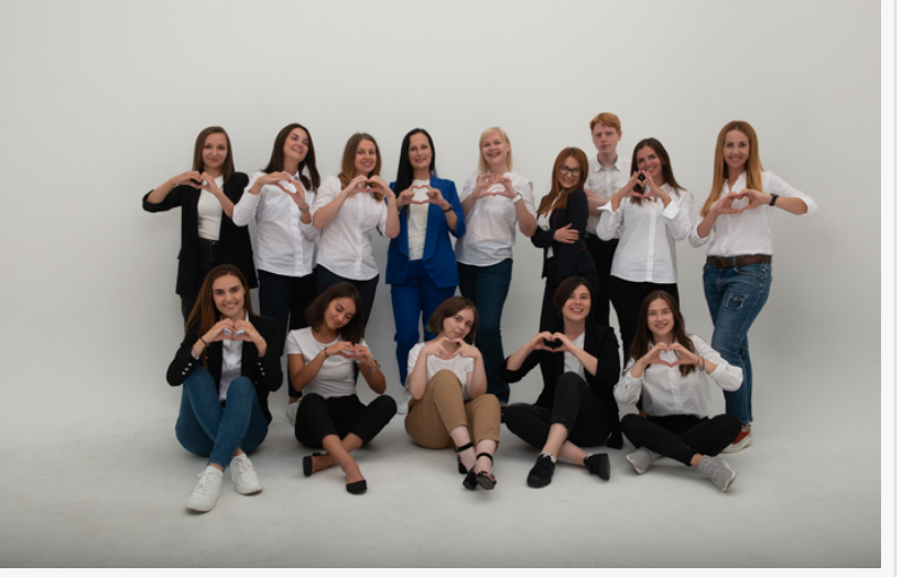
Talentuch IT Recruitment Agency: Team