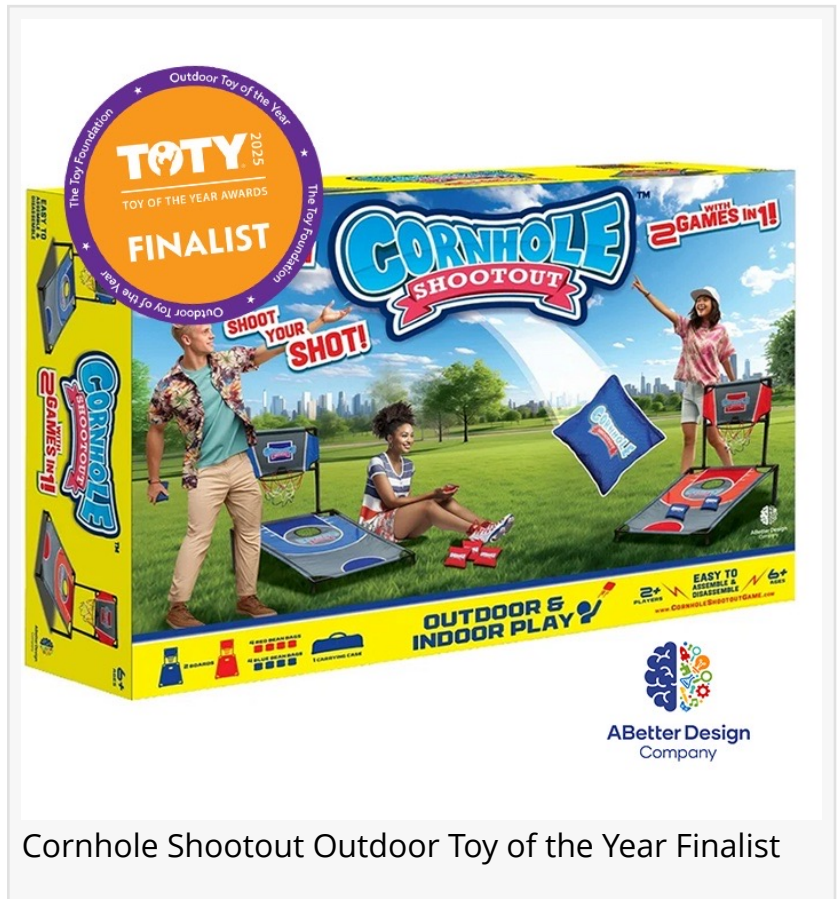
Cornhole Shootout Outdoor Toy of the Year Finalist

Designed to be more forgiving than traditional cornhole, Cornhole Shootout has a basketball basket with backboard attached. Points are scored for players tossing beanbags that go through the hoop, land on the board, and drop through the cornhole. From novice to advanced players, everyone can play, from young children to grandparents.