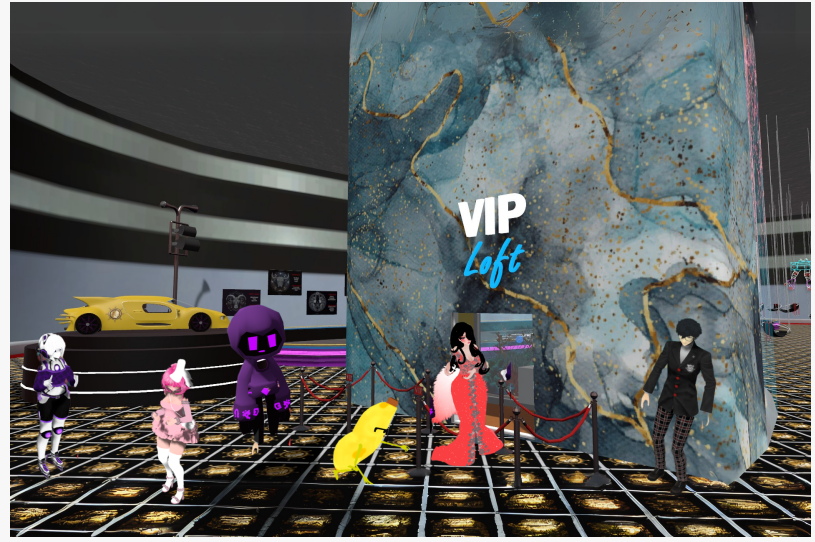
Ferry Godmother and staff in 3D avatars pose in front of the elevator aquarium to the VIP Loft, beside a car displayed on a luxury showroom turntable.

A New Stage for the Arts: From Concert Halls to Virtual Worlds.