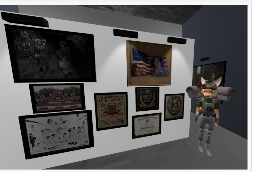
River Art Emporium is dedicated to the Women's Army Corps. This gallery, showcasing art by all veterans, is nestled within the Ferry Godmother Roller Rink.

The <u>Ferry Godmother Roller Rink</u> is more than entertainment. It is a rental venue for small and large businesses, nonprofits, organizations, community groups, clubs, and family events. Whether hosting corporate retreats, workshops, networking mixers, expos, themed gatherings, and family reunions, the rink offers a creative and inclusive environment to connect with audiences in an engaging, accessible format, regardless of physical location and limitation.