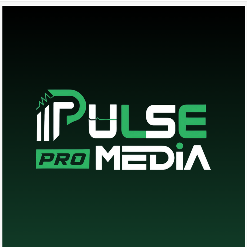
Pulsepro Media - Fastest Growing Digital Marketing Agency in India