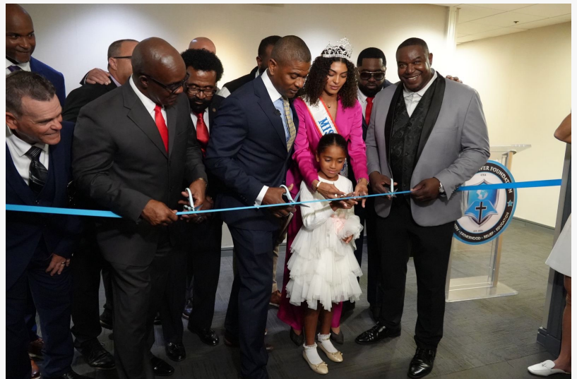
Jack Brewer cuts the ribbon at the opening of the JBF National Fatherhood Center.

JBF's National Fatherhood Center was launched as the hub for JBF's Research & Advocacy division, engaging lawmakers and agencies to address fatherlessness, a critical civil rights challenge. U.S. Census Bureau data shows 18.5 million children—1 in 4 U.S. youth—grow up without a father, with Black children disproportionately affected at 64%. Fatherlessness correlates with 90% of homeless and runaway children, 85% of children with behavioral disorders, and 70% of youths in