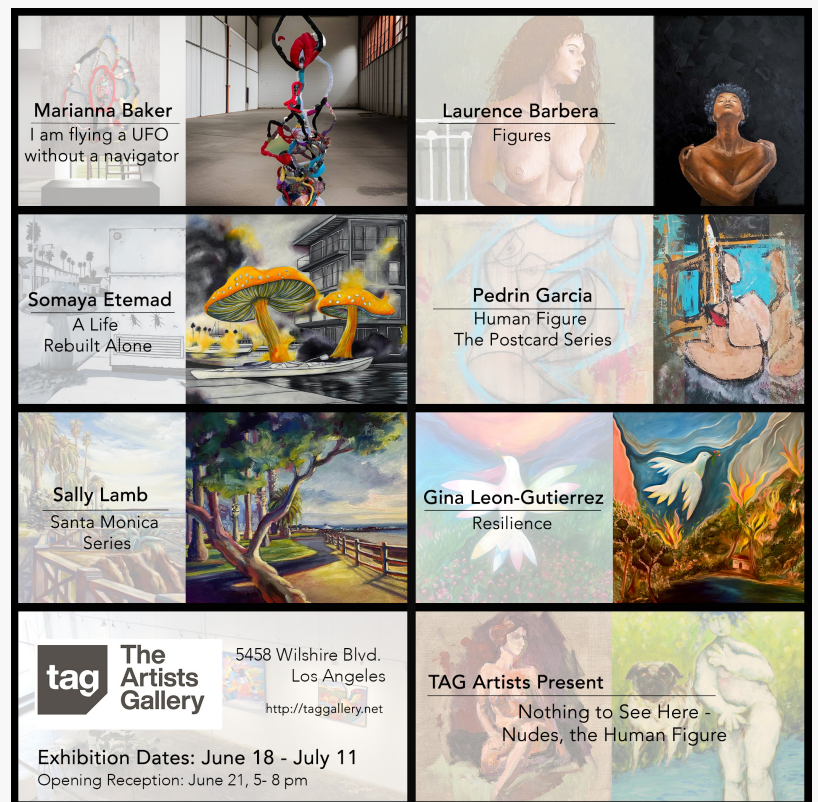
Six Solo Exhibition at TAG in June and July, Reception 6.21.25

Exhibition Dates are Wednesday, June 18 – Friday, July 11, 2025